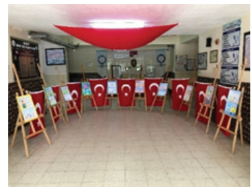
Figure 15. Painting adn Poetry Exhibition