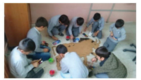
Figure 8. Drama Preparatory Work