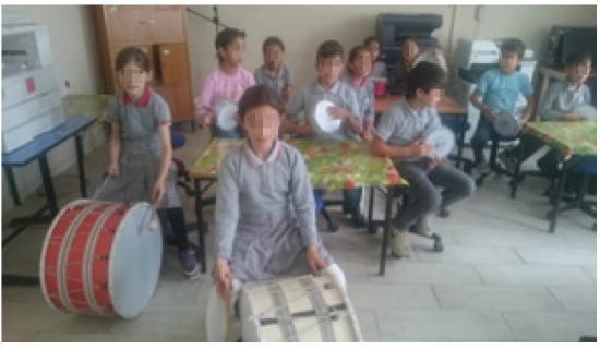
Figure 6. Rhythm Study

Within the plan determined by the researcher, the students in the study group moved to the music workshop during the free activity class hours. Here, students listened to Central Asian Turkish folk music and created rhythm songs with instruments in the music workshop. In addition, Dede Korkut and her poems about heroes have made freelance studies, wrote letters to them. The researcher observed that the students were very happy in this environment and that they were willing to write poems and letters about Dede Korkut and his stories.