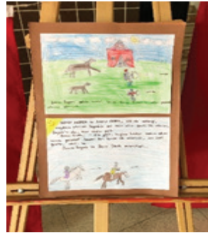
Figure 13. Painting Exhibition

At the end of the study, the students presented their paintings in the visual arts workshop and the poems they wrote in the music workshop in the painting and poetry exhibition held within the school. In addition, all the students in the study group took part in the presentation of the paintings in the exhibition. In this process, the researcher observed that the students were working with a sense of duty, taking their work seriously and showing the exhibition to their friends without harming the exhibition. In addition, the researcher observed that the students in the study group did this work fondly and willingly. In this direction, the researcher concluded that when the students were given tasks and responsibilities, they could be successful by understanding the importance of their work with a sense of responsibility.