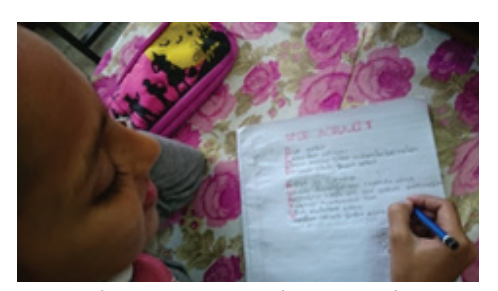
Figure 7. Poetry and Lyrics Study

In this respect, the researcher concluded that writing skills, which are the most difficult and the most difficult to apply among the four basic language skills, can be accomplished when they are realized within a certain plan and the students' tendencies towards writing are considered.