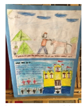
Figure 14. Painting Exhibition