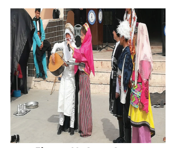
Figure 12. Song Scene