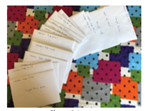
Figure 2. Letters

"What are the observations of the researcher during the application?" the findings related to the sub-problem are given below. In this section, the observer's observations are given.