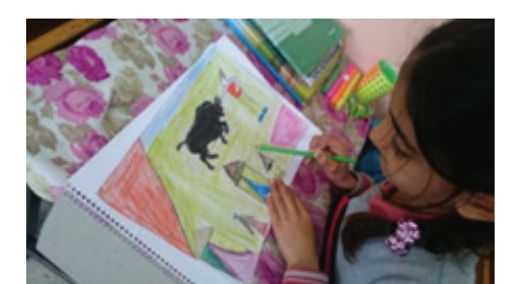
Figure 5. Drawing Work

It is known that the time period in which elementary school children can express their emotions, thoughts and dreams in the best way is painting hours. In this direction, the researcher concluded that students could enjoy expressing their emotions, thoughts and dreams, especially through painting, when they were released without being bound to ready-made forms while summarizing the books they read.